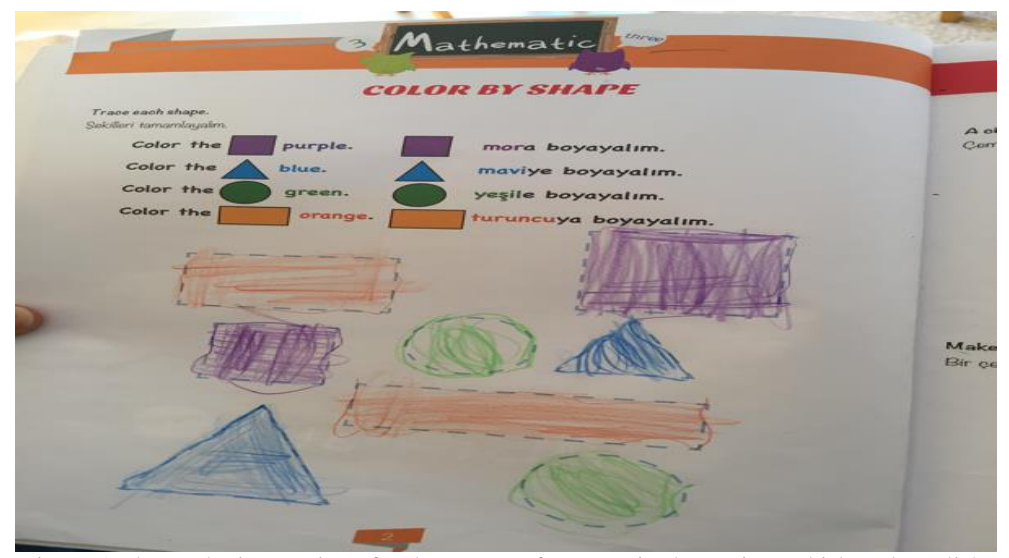
Figure 1. shows the instructions for the names of geometric shapes in Turkish and English.

The figure below was taken from a math activity in which the children developed their math skills. In such activities, as the figure shows, the children are given the instruction in both languages. Figure 1: Learning the geometric shapes.