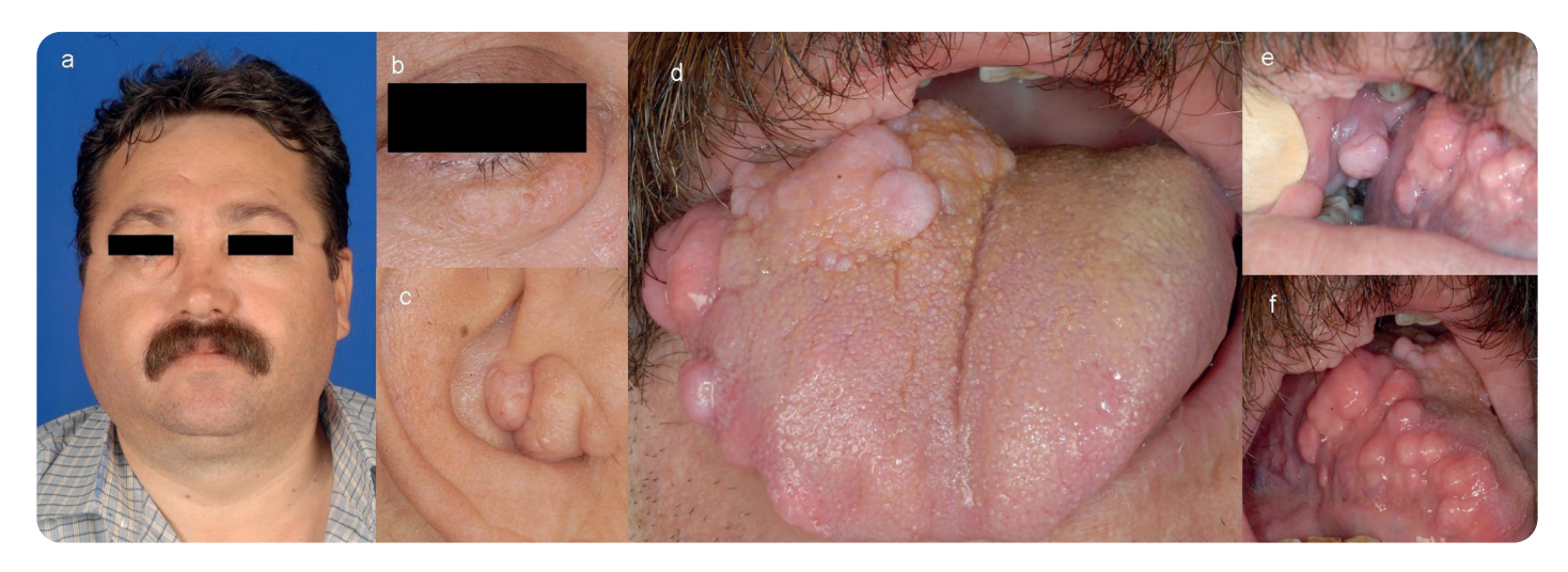
Fig. 1. Facial asymmetry on the face due to the diffuse enlargement of the right side (a), uniformly dense, non-tender mass in the infraorbital region (b), right ear (c), right part of the tongue and the buccal mucosa (d-f).

Fibrolipomas may develop in any region of the body