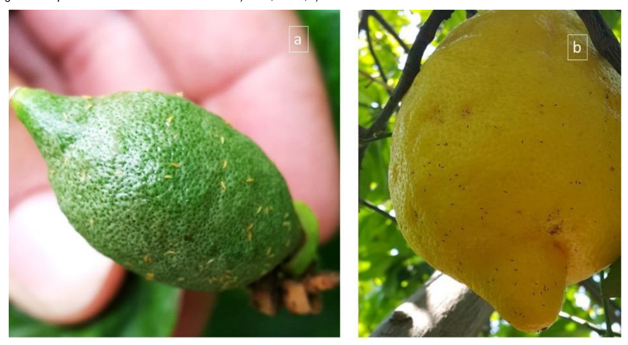
Figure 4. a) Thrips hawaiiensis larvae on an unripe fruit, b) adult and larvae on a ripe fruit.

The experimental design was a randomized block design with six characters (4 insecticides + predatory bug release + control). Each treatment was applied to four replicates consisting of six trees each. One row was left as buffer between each treated plot. The insecticides tested in the first year were 480 g/l spinosad, 25% spinetoram, 100 g/l spirotetramat and 50% flonicamid, and in the second year, 480 g/l spinosad, 25% spinetoram, 100 g/l spirotetramat, 240 g/l tau-fluvalinate. The biological control agent used was the predatory bug, O. laevigatus . The predator adults were released at least a week after spraying to prevent them being exposed to the toxic effects of insecticides. The predators were released using packages of 20 adults up to 24 h old. Seven releases were made starting from full bloom until the fruit were 26-42 mm diameter.