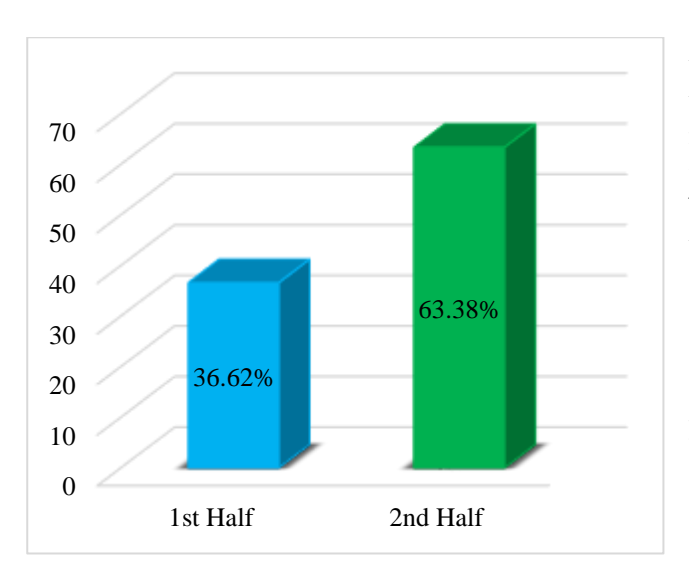
Graphic 1. Half of Goals Scored

Most of the 142 goals scored in the matches played in UEFA EURO 2020 (90 goals - 63.38%) occurred in the second half of the matches.