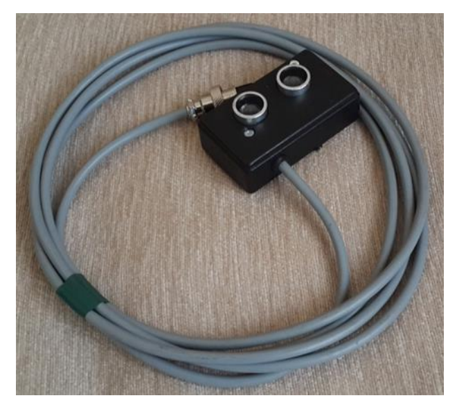
Figure 4. The packaged ultrasonic ranging module HC - SR04.

This module is packaged with a box but it is taken care not to contact the transmitter and receiver sensors to the box. Any contact on them causes a short circuit of sound way. And the measurement became meaningless. The picture of packaged module is presented in Figure 4.