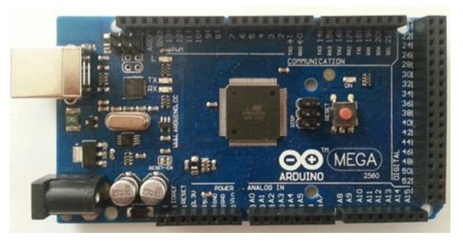
Figure 2. Arduino Mega 2560 Development Board.

The Arduino Mega 2560 is a product of Arduino family, which owns Atmega 2560 microcontroller [18]. Arduino Mega 2560 development board is shown in Figure 2. General properties of the Arduino Mega 2560 development board are given in Table 1. For measuring seed levels in the seed tanks ultrasonic ranging module HC - SR04 was used. It provides 2cm - 400cm noncontact measurement function, the ranging accuracy can reach to 3mm. The modules includes ultrasonic transmitters, receiver and control circuit [20]. This module has a trigger pulse input and an echo pulse output. The microcontroller applies a trigger for at least 10us high level signal to trigger pulse input. And the module automatically sends eight 40 kHz and detect whether there is a pulse signal back. If the signal back, through high level , time of high output IO duration on the echo pulse output is the time from sending ultrasonic to returning. This high level time is converted to distance by using velocity of sound. The HC - SR04 module is presented in Figure 3.