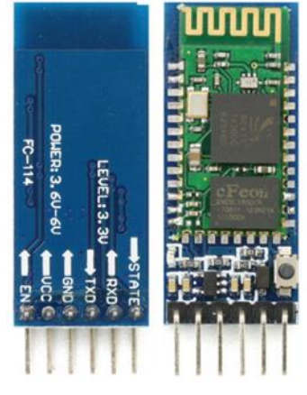
Figure 5. HC05 Bluetooth module.

In the tractor side it is used as master mode. And in the seeder side it is used as slave mode. By using AT command same name and password was assigned to the both of modules as SHTT and 654321 name and password respectively. The HC05 Bluetooth Module is presented in Figure 5.