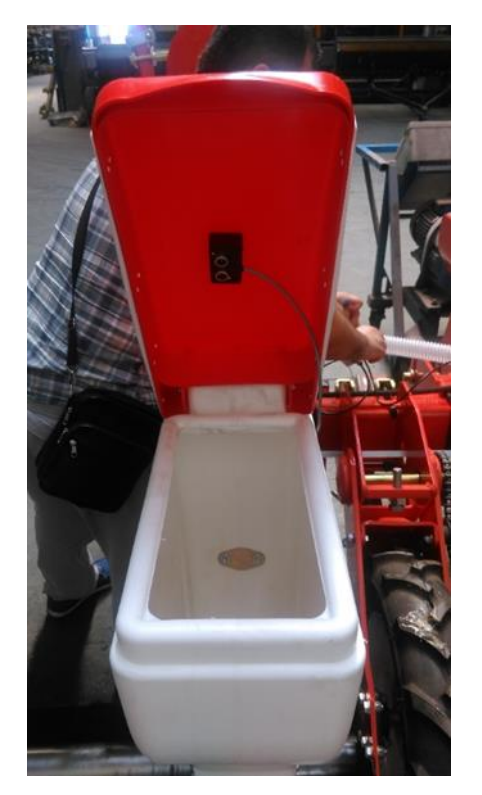
Figure 7. The montage of ultrasonic distance meter on seed tank

The seed volume in the seed tank continuously controlled by the user with the developed system. And the volume of the seed in the tank is presented simultaneously to the user. By this way the user ergonomics have been ensured. In a situation such as the do not fall of the seed sourced from any mechanical parts, the user can follow the tanks and notice the situation early. If no change of the seed volume in the tank have been observed for a while, it means planting was not been performed. This system can be also used in grain sowing machines.