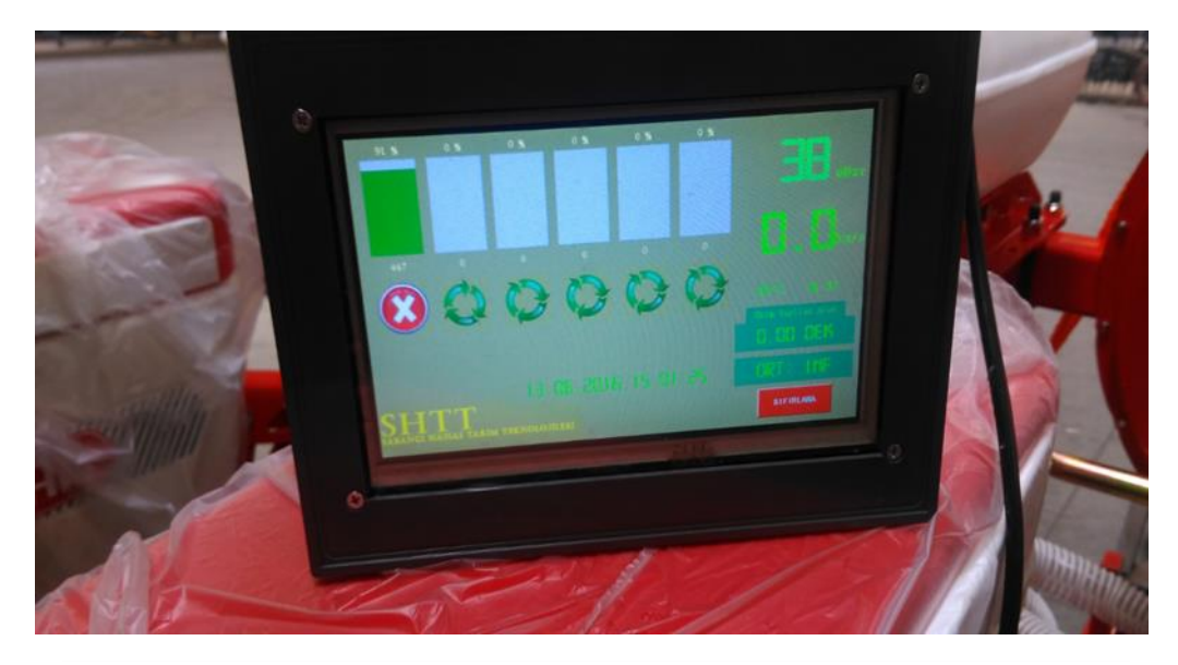
Figure 8. The boxed Nextion NX8048T070 TFT screen that used as graphical user interface