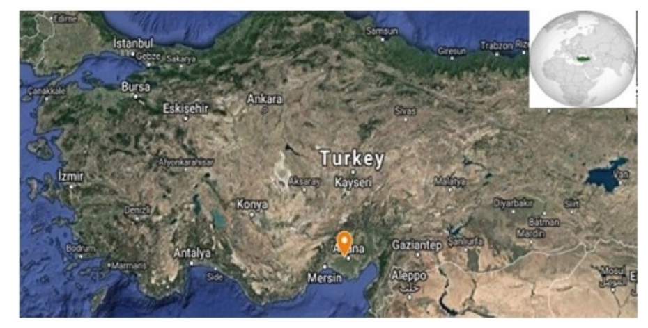
Figure 1. Sampling sites (stations) of the study (Anonymous, 2019).

Mediterranean areas of Turkey; the first crop in March-June and the second crop in July-October. A maize (Pioneer Hybrid 1/2013) crop of 0.4 ha was established on 15 March 2018 as the first crop of maize. The second crop of maize was planted on 12 June 2018. Interrow and intra row spacing was 45 cm and 20 cm, respectively. No pesticides were applied during the entire period of the study.